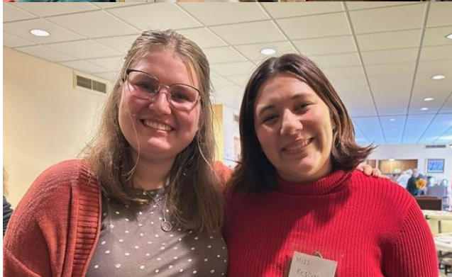
photo release waivers were filled out by parents to allow for photography for sharing our youth’s activities in print and online.

In September, we began again offering Sunday School for the children ages K-5th grade. Volunteers taught the classes until Kesslyn Cay and Bree Daly, Education students from Spring Arbor