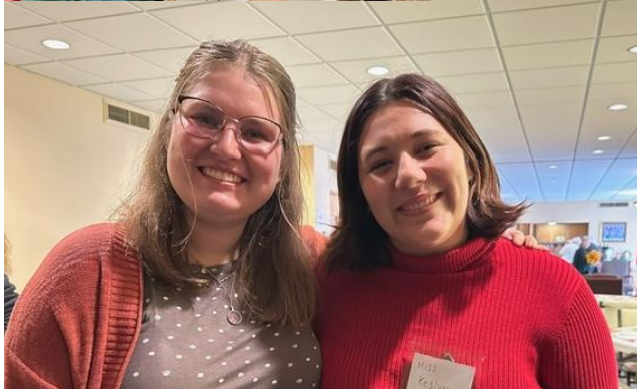
photo release waivers were filled out by parents to allow for photography for sharing our youth’s activities in print and online.

In September, we began again offering Sunday School for the children ages K-5th grade. Volunteers taught the classes until Kesslyn Cay and Bree Daly, Education students from Spring Arbor